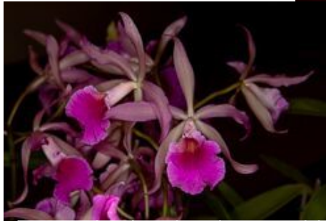
AMN-093 (Slc. India Rose Sherwood x B. Little Stars)