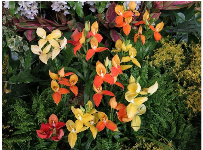
Disa's at the Show